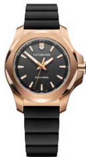
241808 Ø 37 mm