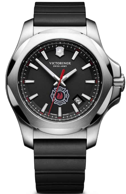
FIRE DEPARTMENT NEW YORK

The company logos printed herein are shown for demonstration purposes only and remain property of the respective company.