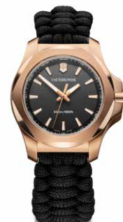
241880 Ø 37 mm