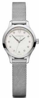
241878 ** Ø 28 mm