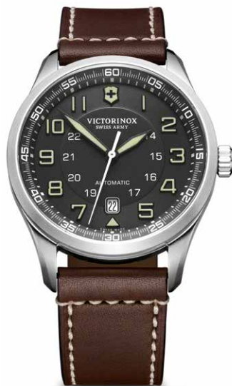
241507 Ø 42 mm

Genuine leather strap Fabric strap with iconic red stitching