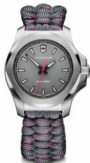
241771 Ø 37 mm