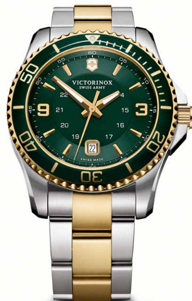
241605 * Ø 43 mm