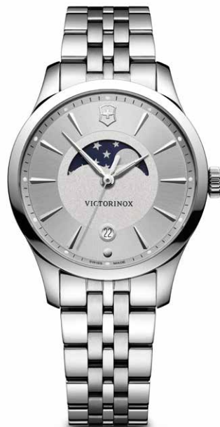
241833 * Ø 35 mm

Stainless steel bracelet (316L) PVD treatment on bracelet**