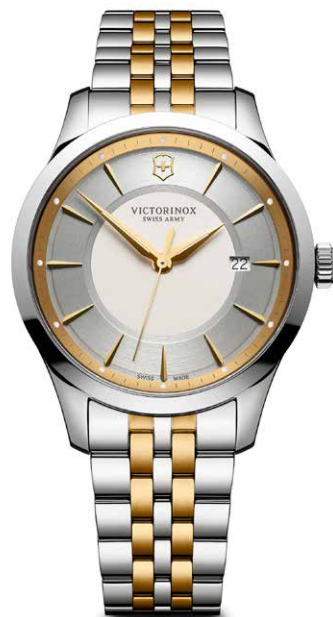
241803 Ø 40 mm