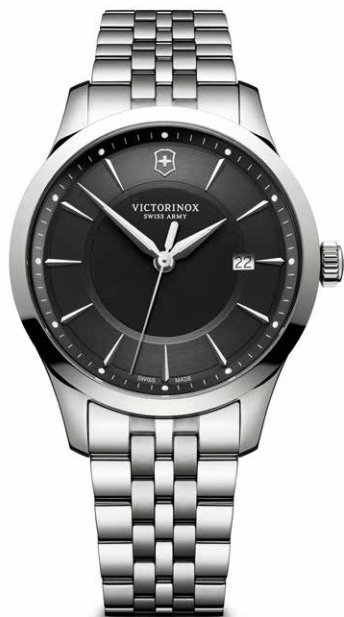
241801 Ø 40 mm