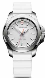
241769 Ø 37 mm