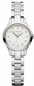
241875 * Ø 28 mm