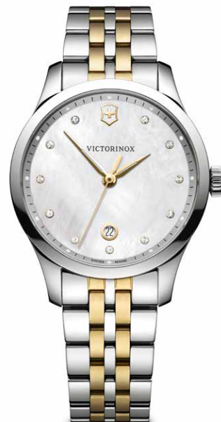
241831 ** Ø 35 mm