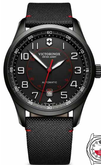
241720 * Ø 42 mm