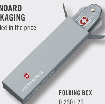
FOLDING BOX 0.2601.26