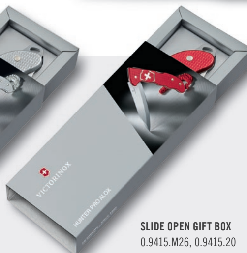
SLIDE OPEN GIFT BOX 0.9415.M26, 0.9415.20