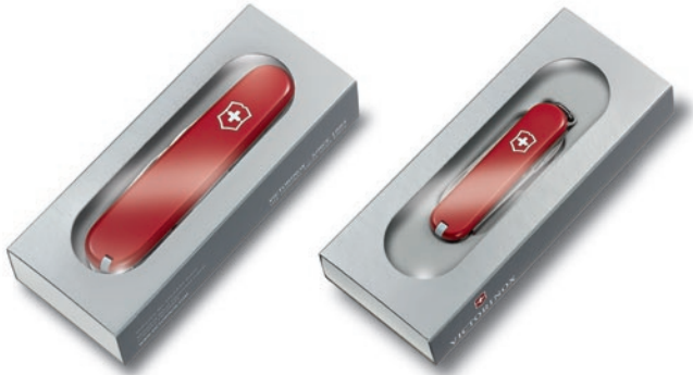
B 1-4 SLIDE OPEN GIFT BOX WITH CLEAR WINDOW