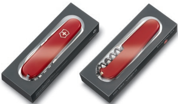
C CLEAR WINDOW FOLDING BOX