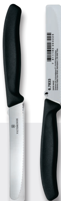
BLADE PROTECTION 6.7833