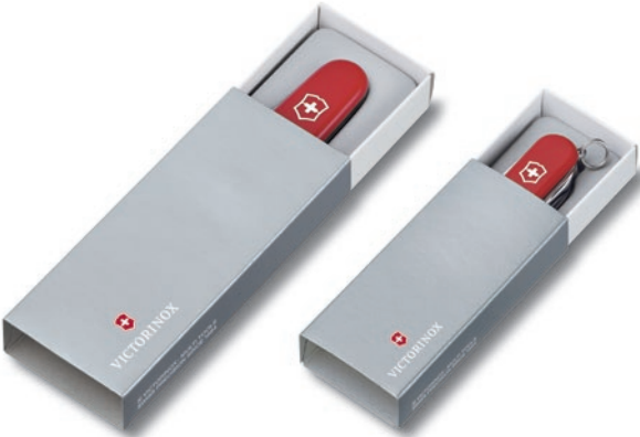
A 1-11 SLIDE OPEN GIFT BOX